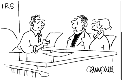
IRS I see you've laid up your treasures in heaven. Is this some sort of tax dodge?