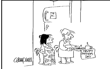
“Let’s take the corn flakes just in case” Happy Mother’s Day!